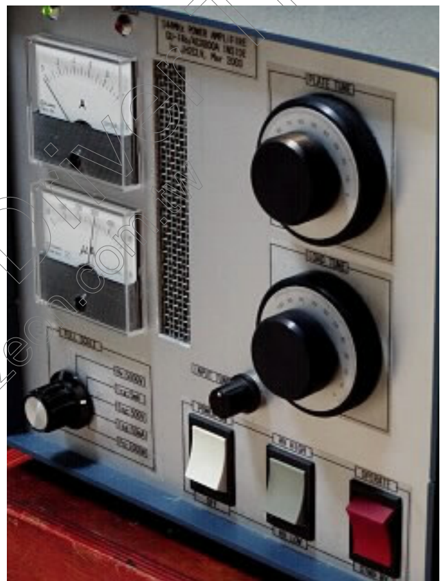
Top Left Front & Top View