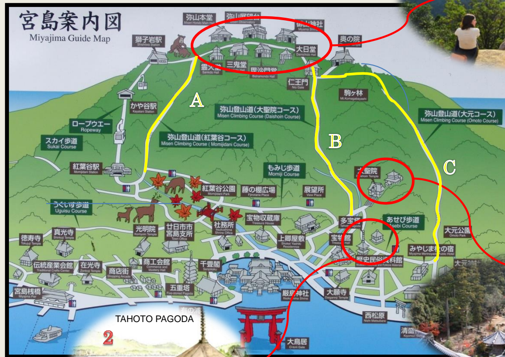
DAISHOIN TEMPLE 3

The Tahoto pagoda dates from 1523 and is 15.6m high. It was built by the monk Shukan and its structure is based primarily on Japanese style but part of it has architectural influence from India and China. It is notable for combining a unique square-shaped in its lower level and a round upper level. It is hidden in the top of a hill, from where you can take a forest road that leads to the recommended course no. B, the area of the Daishoin Temple. During cherry blossom weeks it will make an attractive walk for tourists. There is a small park to enjoy nature and one of the most beautiful views.